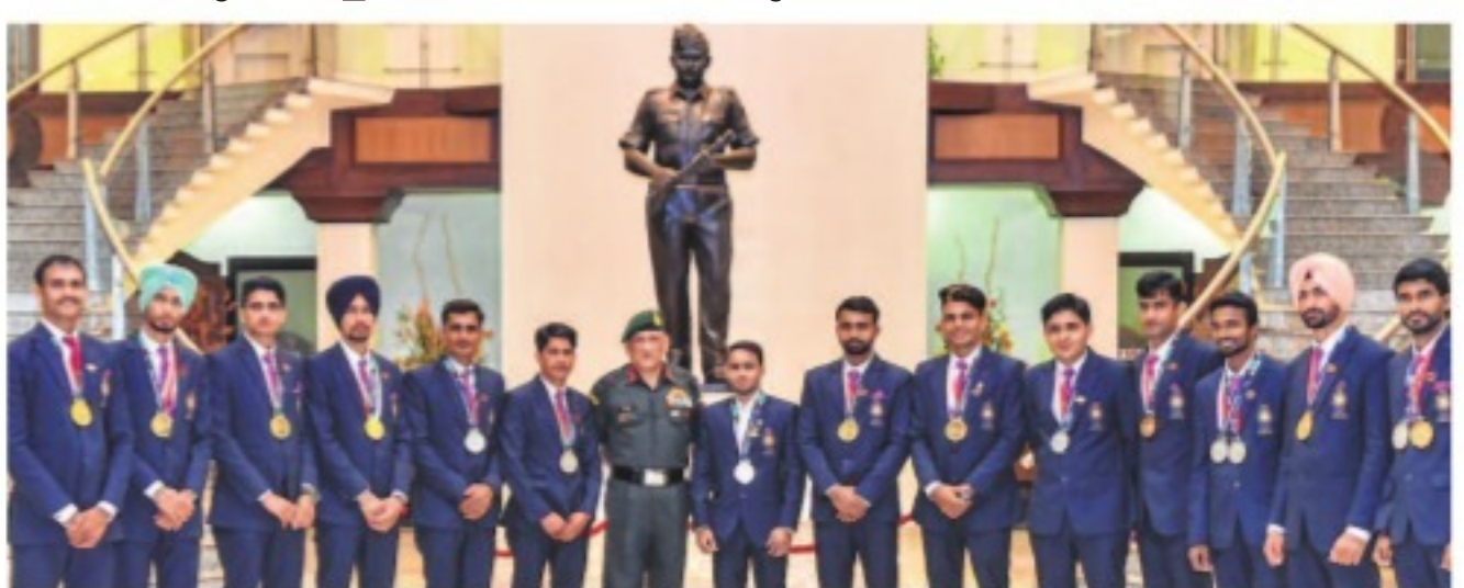
Army Chief Gen. Bipin Rawat, poses for a group photo with sportsmen from army who won medals in Asian Games 2018, in New Delhi, Wednesday