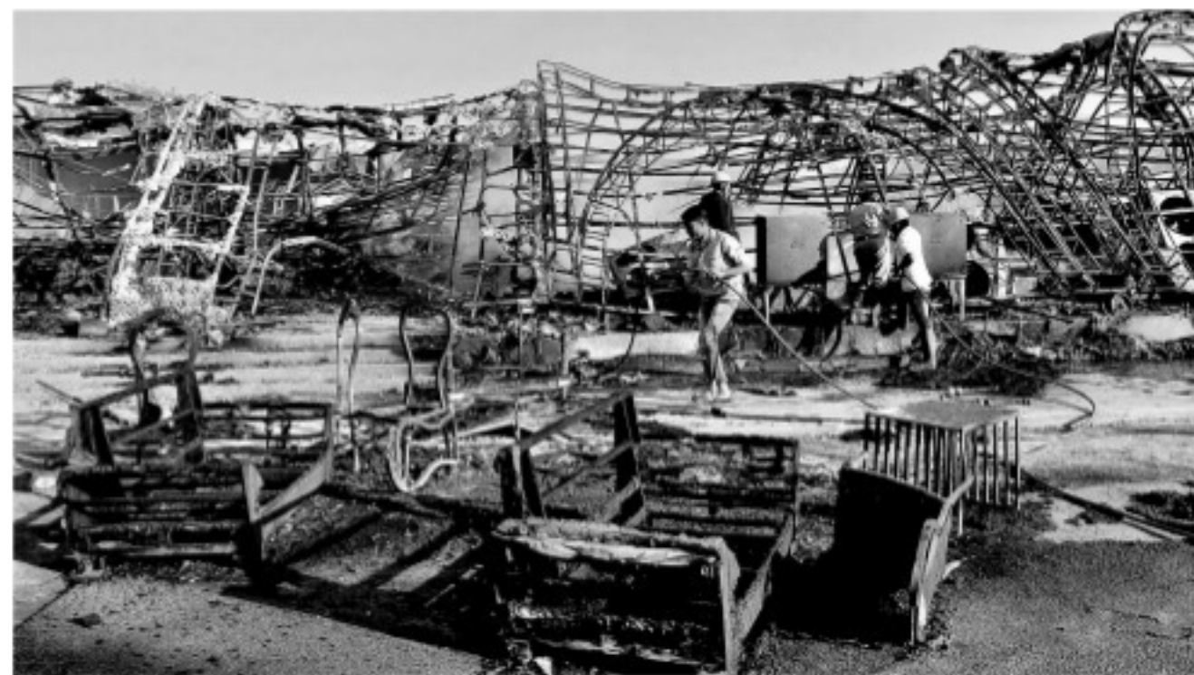
Firefighters trying to douse fire at the Jawahar Circle area in Jaipur on Thursday