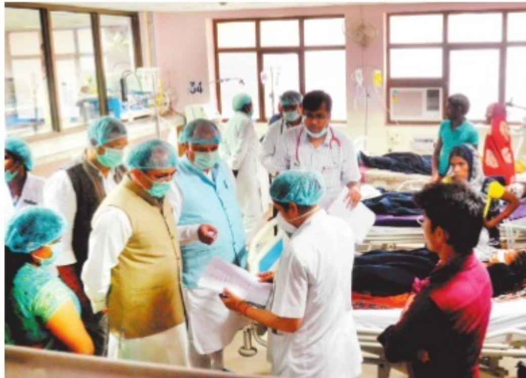
Uttar Pradesh Health Minister Siddharth Nath Singh and Medical education minister Ashutosh Tandan visits BRD Medical College where at least 30 children died in the past 48 hours, in Gorakhpur on Saturday

Lucknow Terming the death of infants in a state-run hospital in Gorakhpur as an outcome of the Uttar Pradesh government's 'gross criminal negligence', the SP and BSP on Saturday demanded a high-level inquiry into the incident. Both the opposition parties in the state have decided to send teams to Gorakhpur. "As many as 60 children have died in a government hospital in Gorakhpur in the last six-seven days. This is an example of gross criminal negligence of the BJP government," Bahujaan Samaj Party (BSP) chief Mayawati said in a release here. Blaming the Yogi Adityanath government for the tragedy, Samajwadi Party (SP) president Akhilesh Yadav claimed that a shortage of oxygen supply in the hospital led to it.