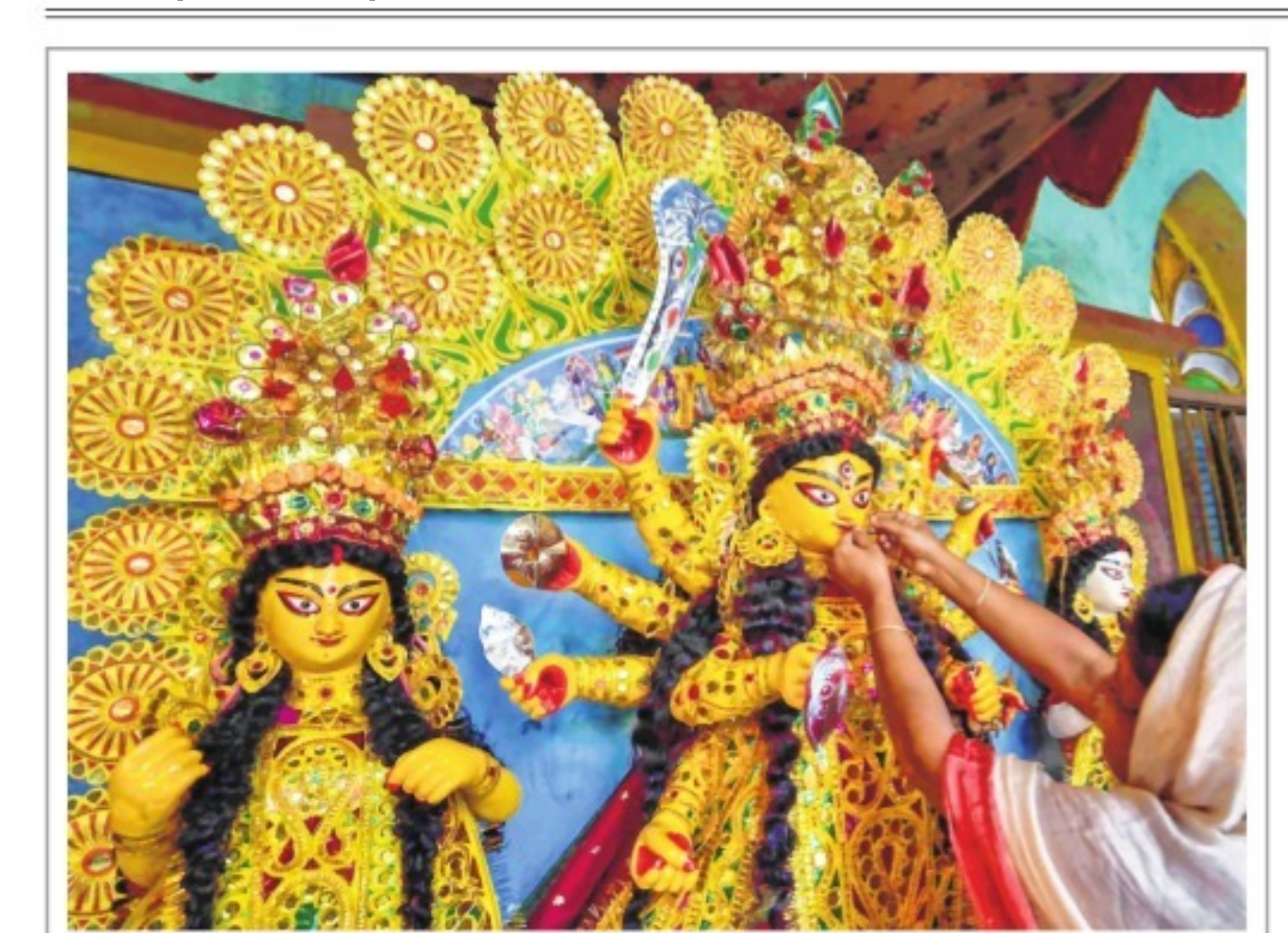
An idol of Goddess Durga being decorated with gold ornaments at a traditional 189 years old puja house on Mahashasthi of Durga Puja festival in Kolkata on Monday

14. NGO Justice for Rights Foundation, in its plea, has claimed that online media streaming plaftforms, also including Hotstar, show content which is "unregulated and uncertified" for public viewing.