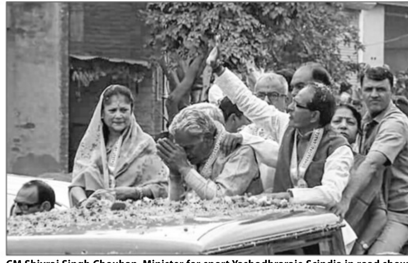
CM Shivraj Singh Chouhan, Minister for sport Yashodhraraje Scindia in road show in Kolaras before filing of the nomination papers of Devendra Jain, the BJP candidate