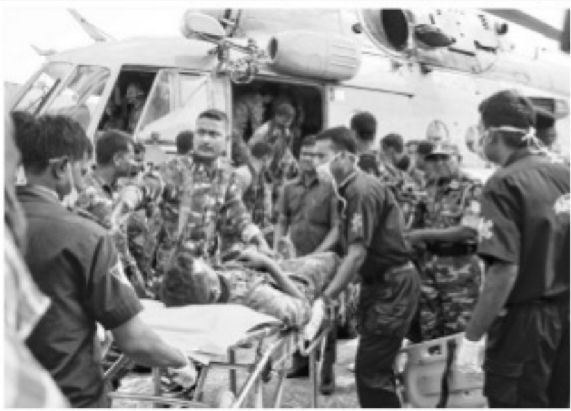
RPF personnel injured in an IED blast triggered by Naxals Seraikela Kharsawan district being airlifted for treatment in Ranchi on Tuesday